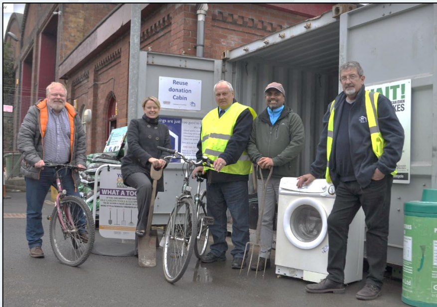
Eshiels Community Recycling Centre – Re-Use Cabin