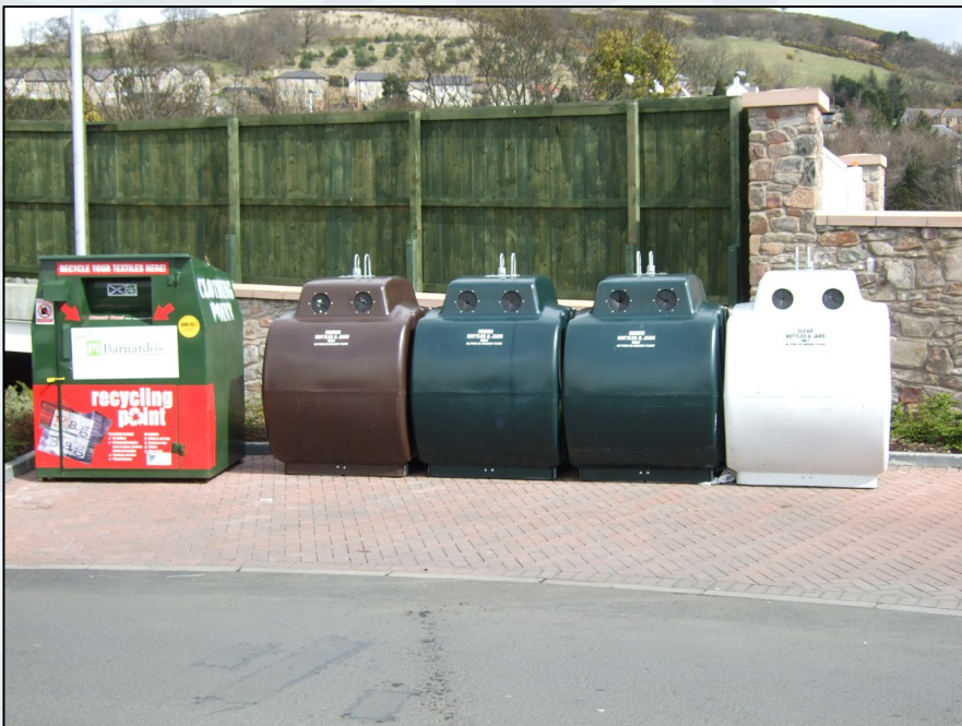
Tesco, Galashiels – Recycling Point